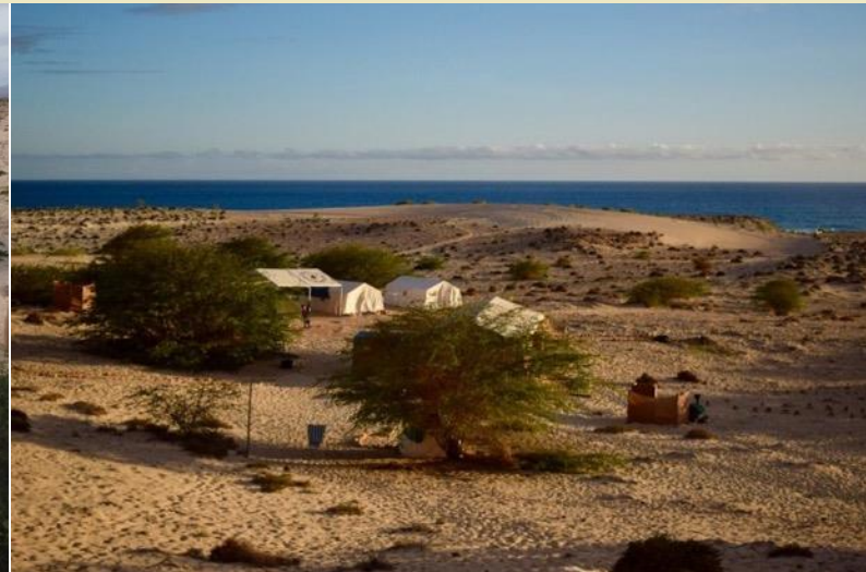
Boa Esperança Camp