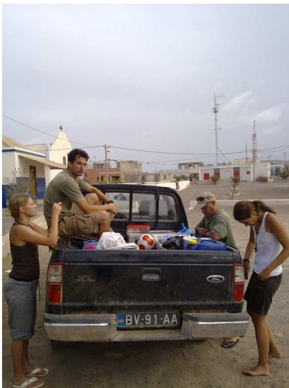
Ready to drive to the camp