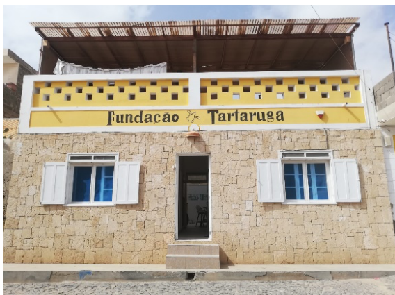
Turtle Foundation headquarter in Sal Rei