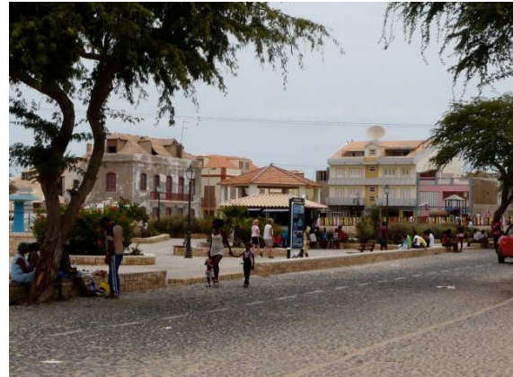
Sal Rei, the capital of Boa Vista